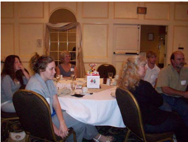
Pretty serious and attentive!