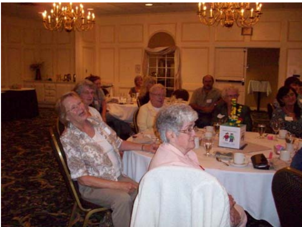
Okay, so that was pretty funny!